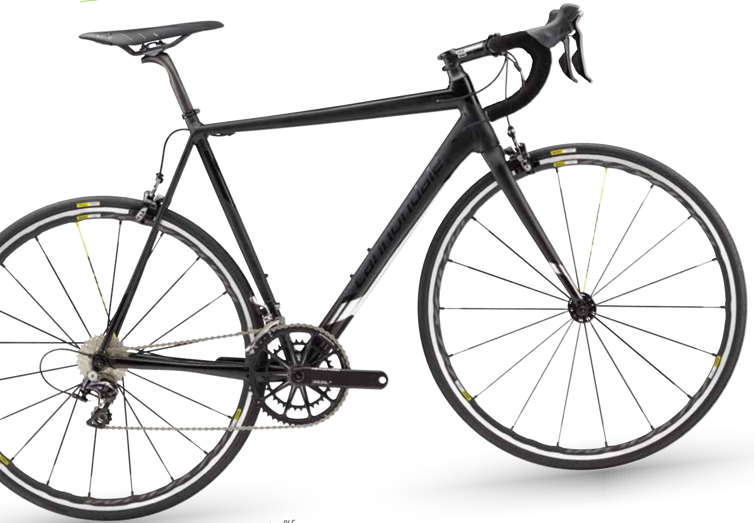
☞ Satin Black w/ Gloss Black and Polished Chrome accents - BLE