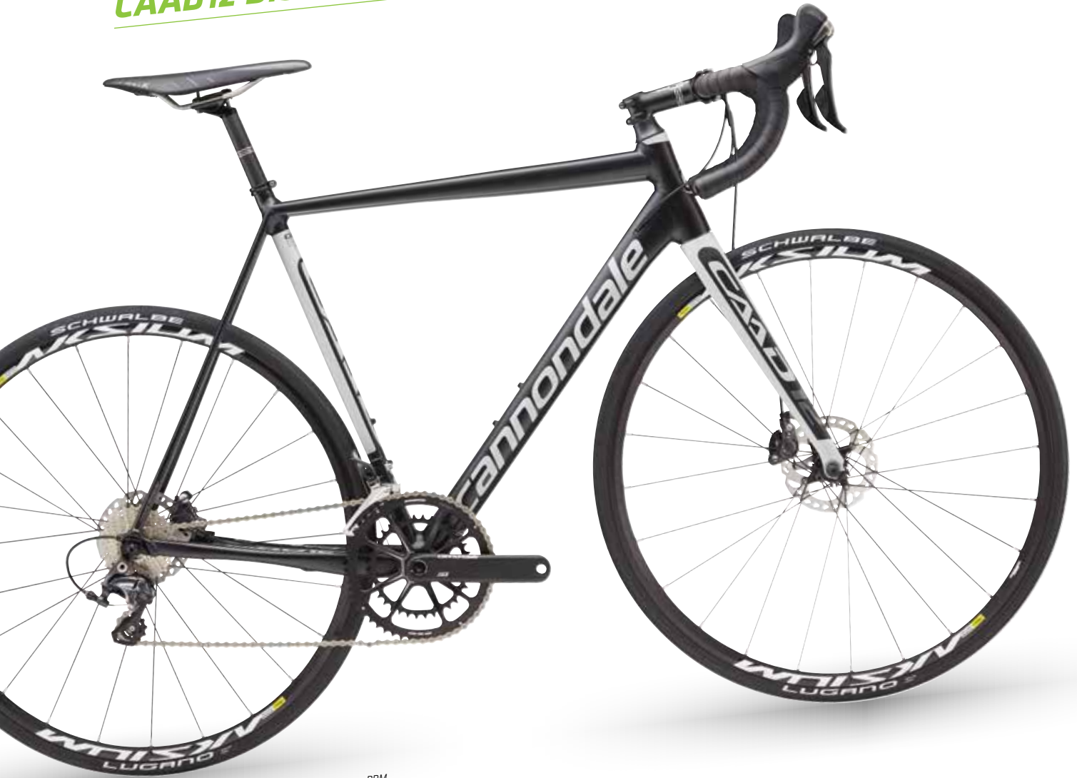
Jet Black w/ Charcoal Grey and Primer Grey, Gloss - PRM