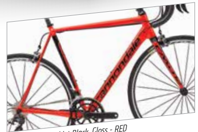
🔑 Acid Red w/ Jet Black, Gloss - RED