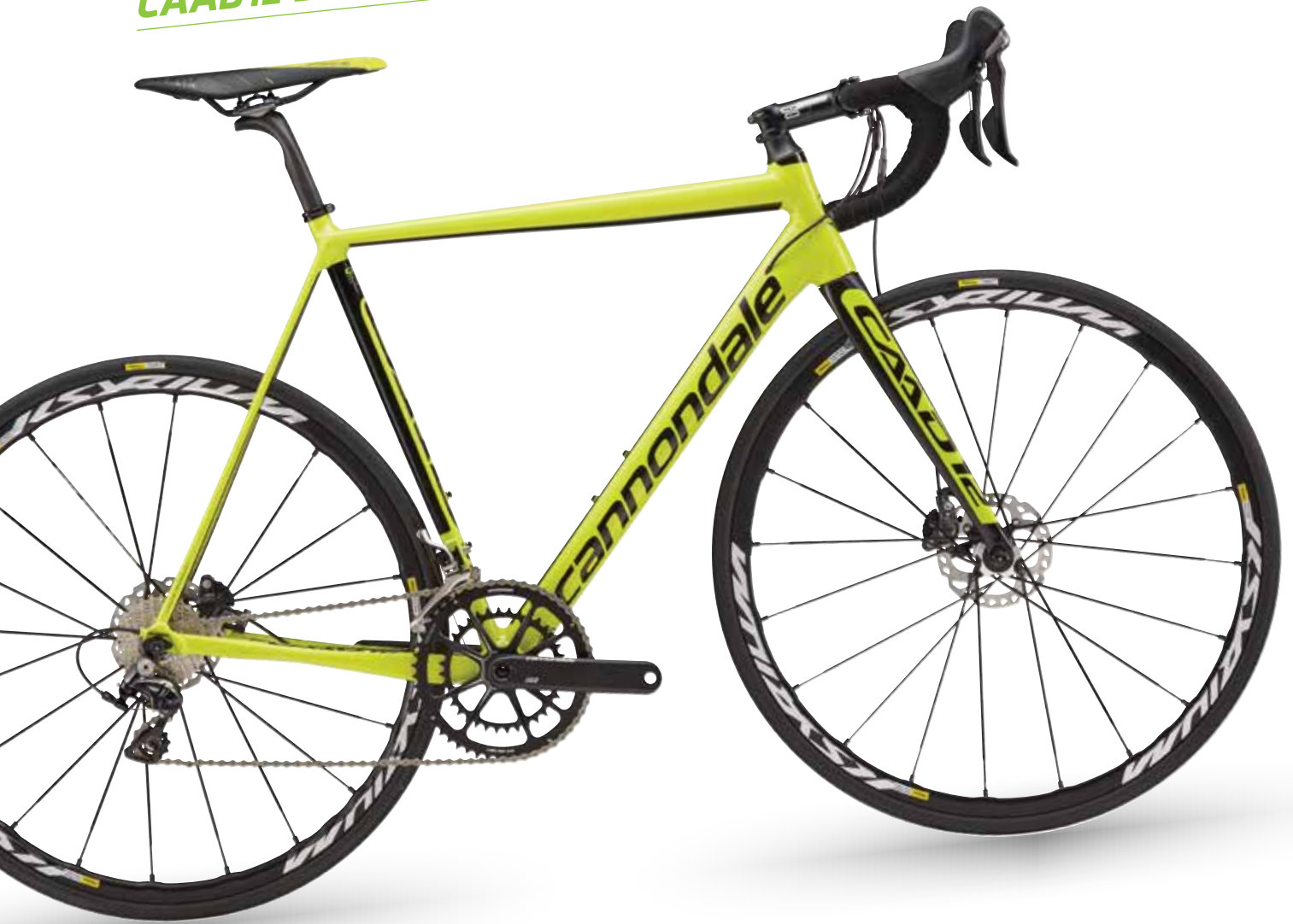
Neon Spring w/ Jet Black, Gloss - NSP