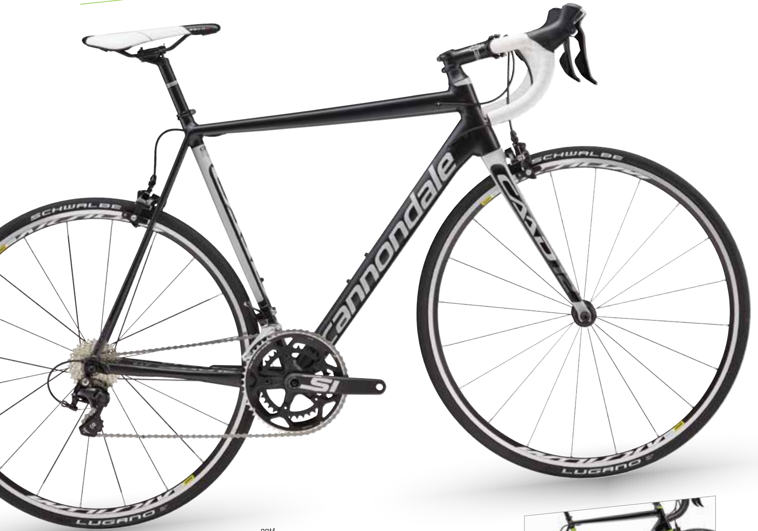
🏆 Jet Black w/ Primer Grey and Charcoal Grey, Matte - PRM