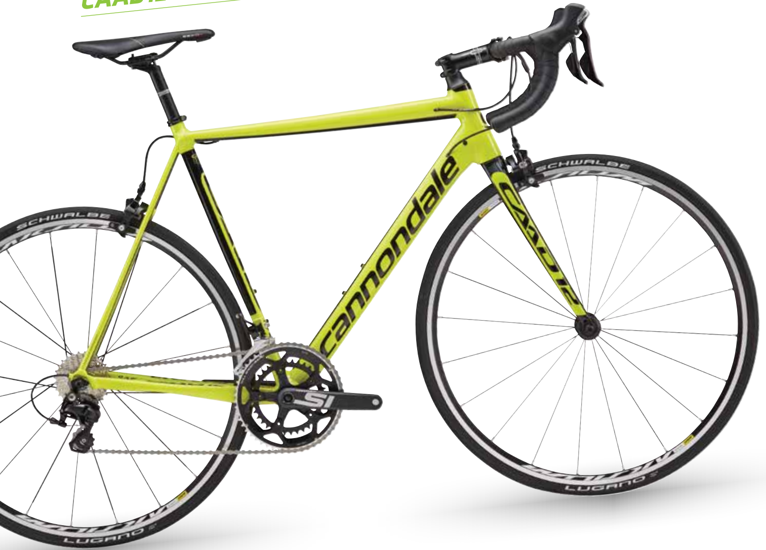
☞ Neon Spring w/ Jet Black, Gloss - NSP