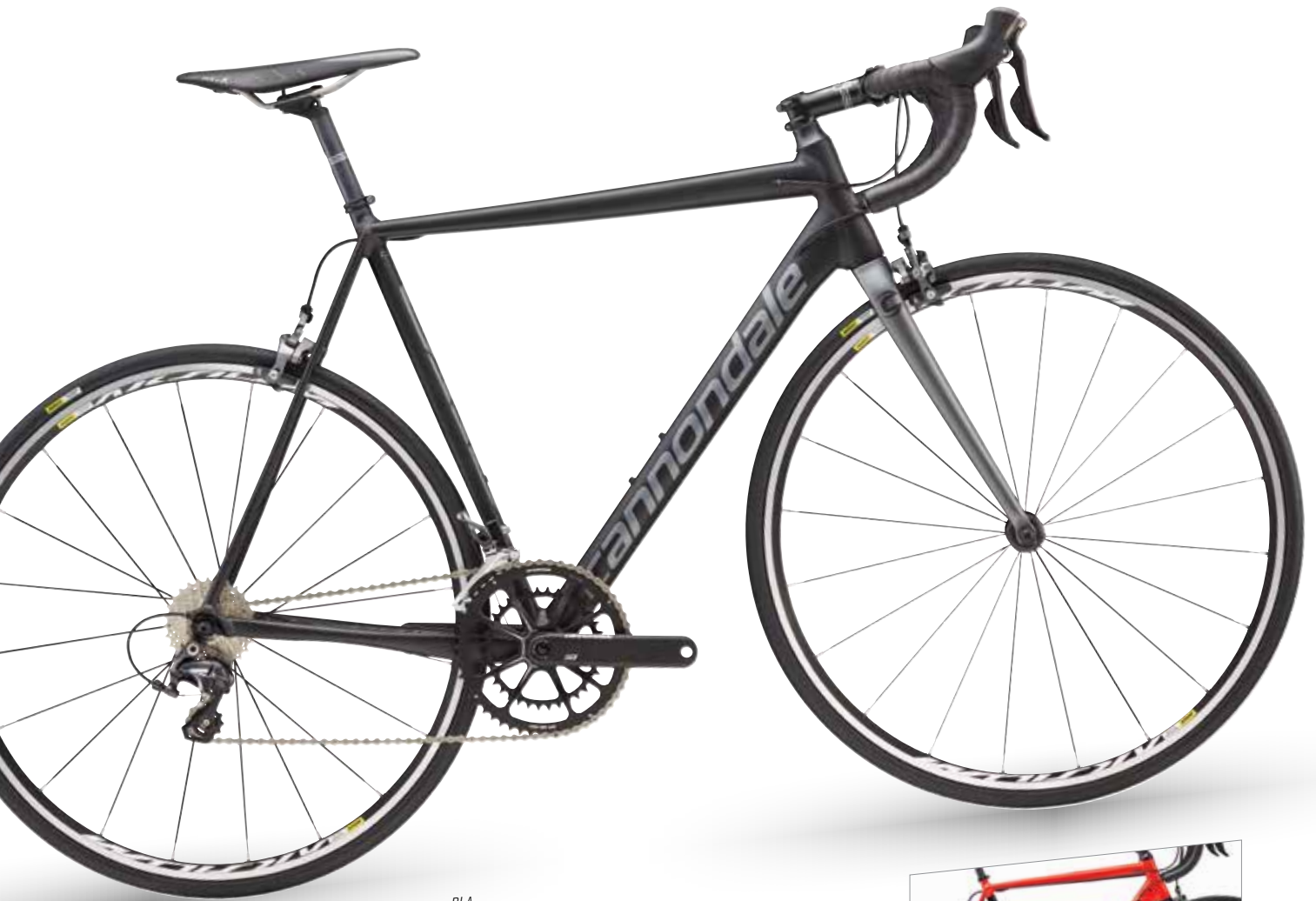
Jet Black w/ Charcoal Grey and Primer Grey, Matte - BLA