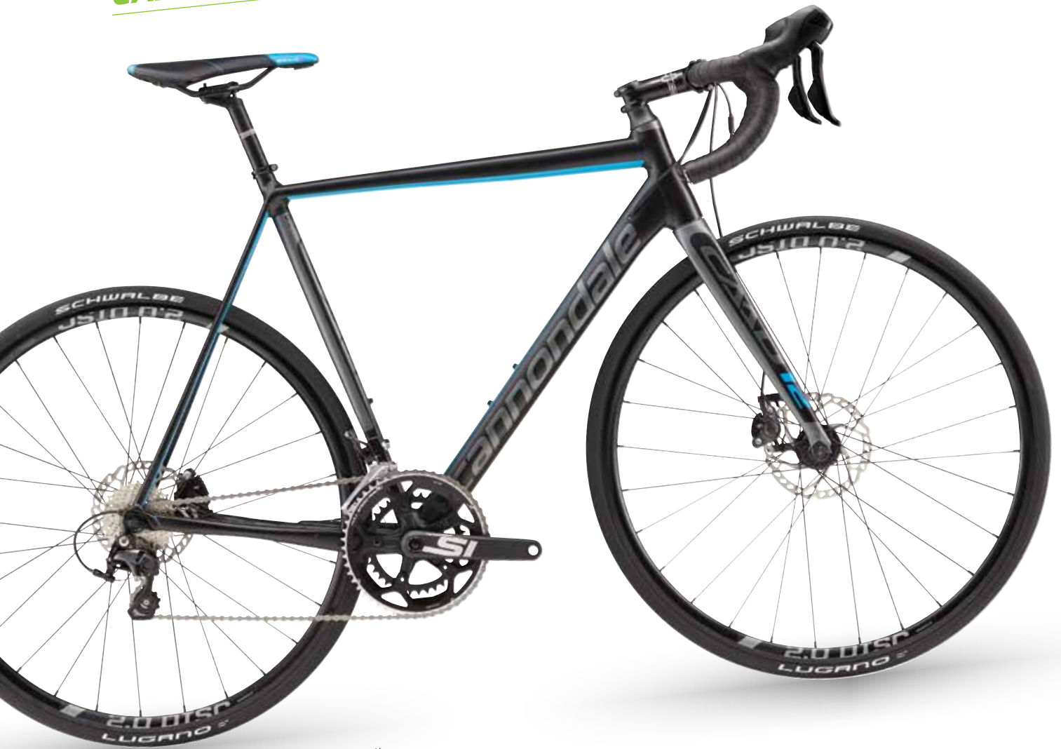
☞ Matte Jet Black w/ Charcoal Grey, Gloss Ultra Blue - BLU