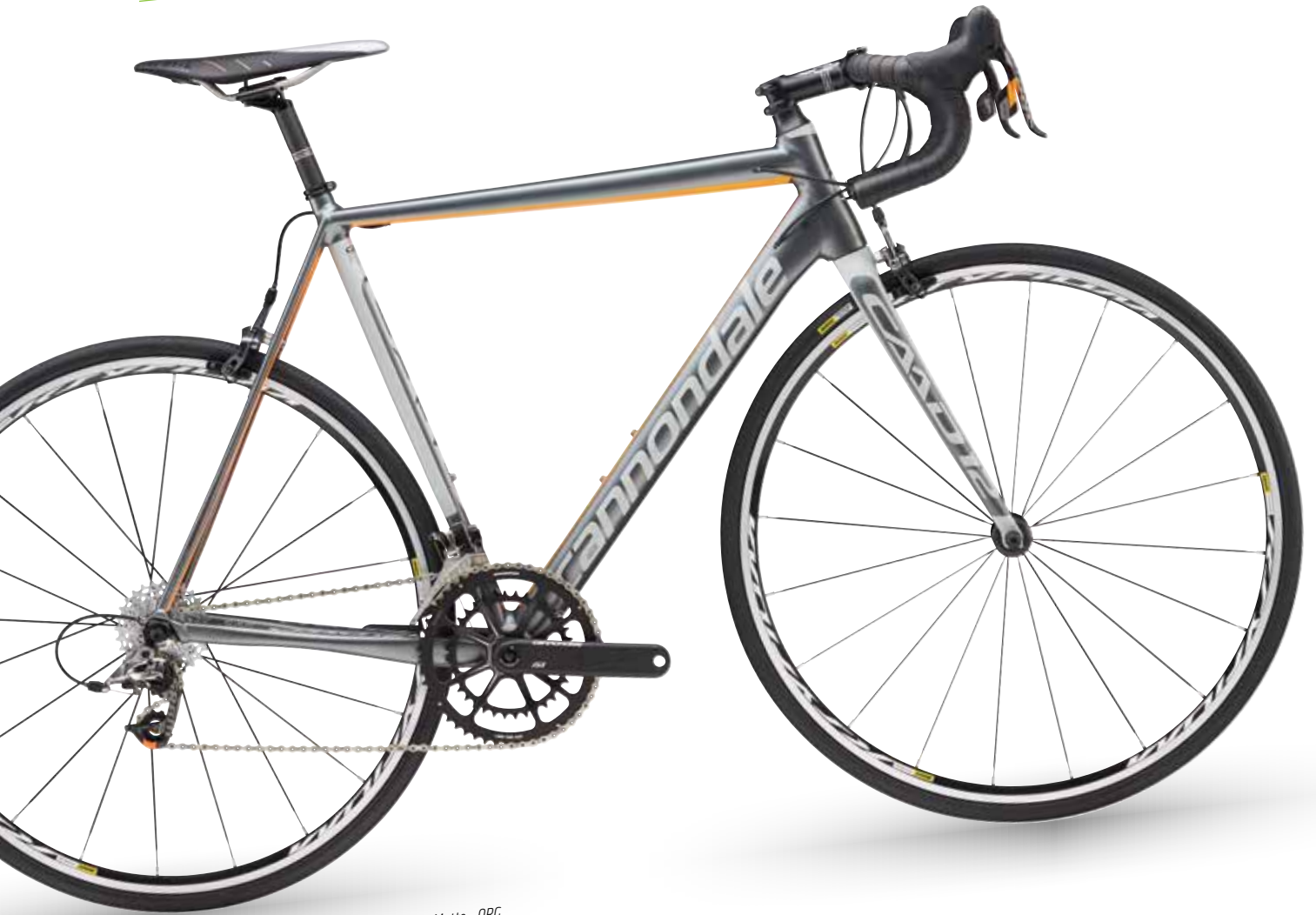
Charcoal Grey w/ Primer Grey and Acid Orange, Matte - ORG